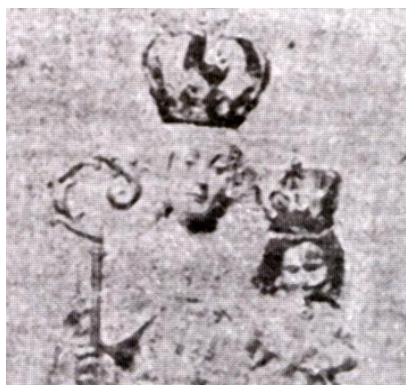
Photographic Image taken in 1941 of Our Lady of Good Success Statue. Published in the Quito Newspaper "El Comercio," describing the 1941 miraculous animation of the statue.

Prayer for Every Day and Antiphon (Pages 12 & 13)