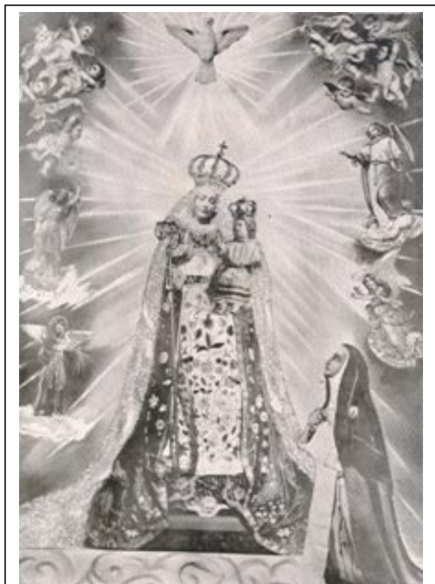
Photographic image of the Statue with enhanced imagery surrounding it --- 20 th Century. Surrounding the miraculous statue is St. Francis, the Three Archangels and Mother Mariana.